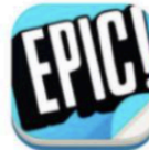
EPIC books for kids